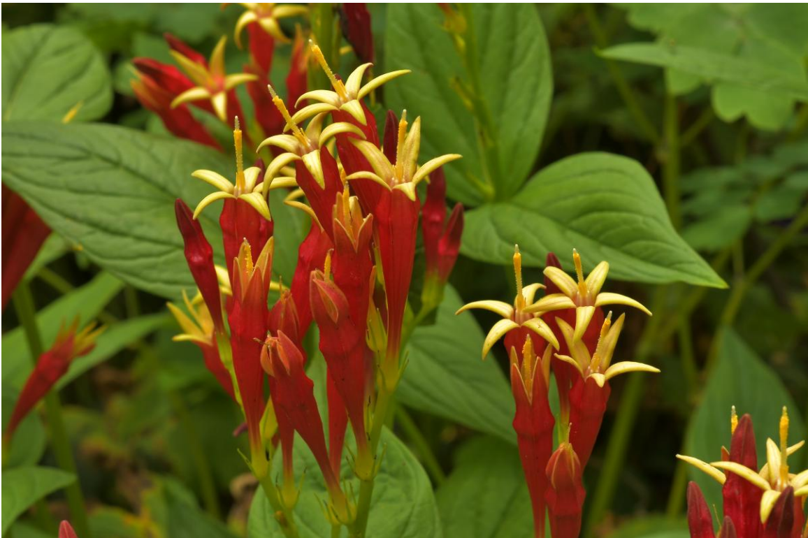
Spigelia marilandica – Indian Pink